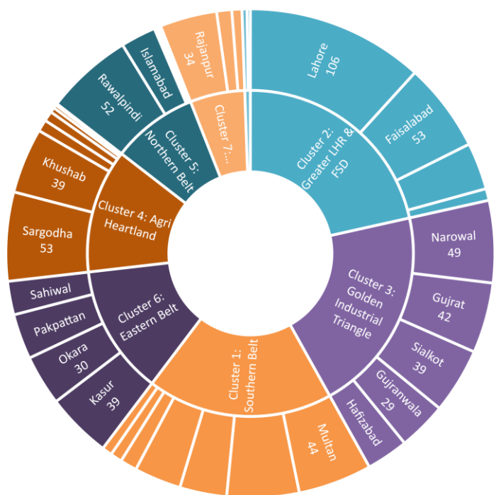
Graph: Cluster & City Wise Projection